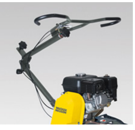
Standard guide handle with adjustable handle and foldable center pole for easy transport

Height adjustable handle with Pro-Shift® System enables continuous adjustment of the floating blade pitch as well as individual height adjustment.