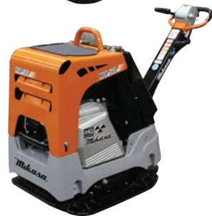
Plate size WxL in (mm) - 24x34 (600x860) Centrifugal Force lbs. (kN) - 10,116 (45) Exciter Speed VPM - 4,400 Operating Weight lbs. (kg) - 794 (360) Max travel Speed ft/min (m/min) - 79 (24) Cyclonic Pre-Cleaner - Single