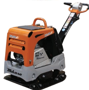
Plate size WxL in (mm) - 19.7x28.3 (500x720) Centrifugal Force lbs. (kN) - 8,318 (37) Exciter Speed VPM - 5,200 Operating Weight lbs. (kg) - 463 (210) Max travel Speed ft/min (m/min) - 85 (26) Cyclonic Pre-Cleaner - Single