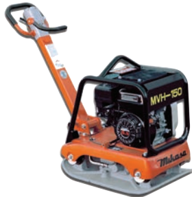
Plate size WxL in (mm) - 15.8x23 (400x580) Centrifugal Force lbs. (kN) - 5,058 (22.5) Exciter Speed VPM - 6,000 Operating Weight lbs. (kg) - 256 (116)