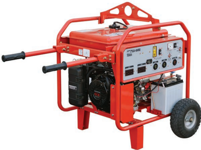
GA6HRS 6000 watts max. Honda engine, recoil/electric start Battery sold separately Battery specifications: 12N243A / MQ# 0162212024