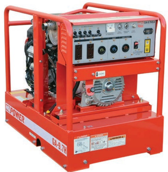
GA97HEA 9700 watts max. Honda engine, electric start Battery Specifications: 38B19R / MQ# Y0165103819