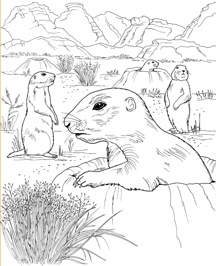
Color the picture of the prairie dogs.

Will you confess your sin and receive Jesus Christ as your Savior? Will you find your refuge and safety from judgment in Him? "In the fear of the Lord is strong confidence: and his children shall have a place of refuge (Prov. 14:26)."