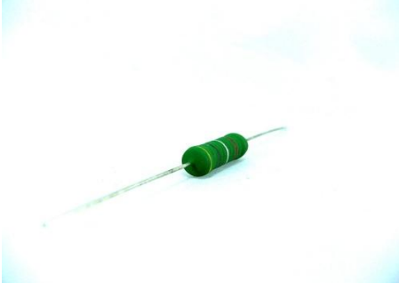
5 Watt - 1%