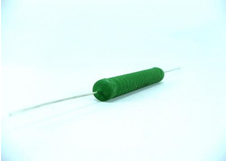
10 Watt - 1%