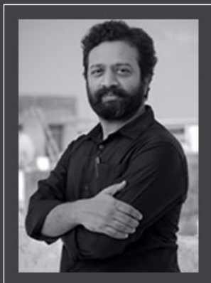
Founder of Mill Power Pvt. Ltd.