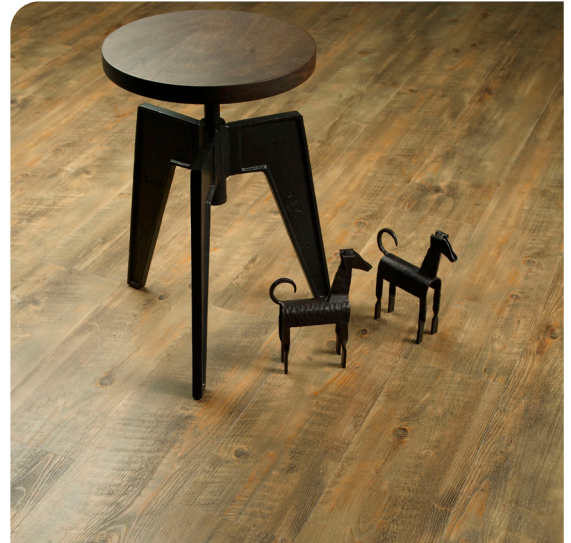
El Paso GWC 9814