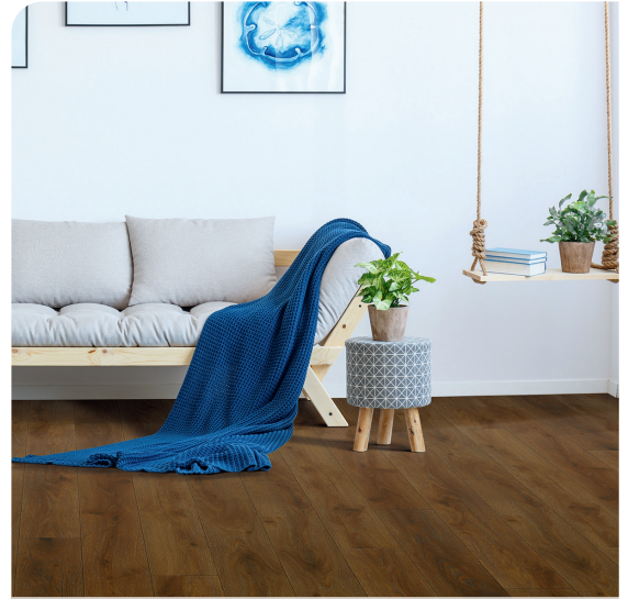
Saddle - SHB 2168 CB