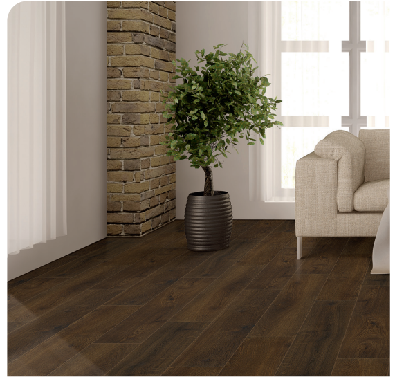
Brown Bear - PKH 383 CB