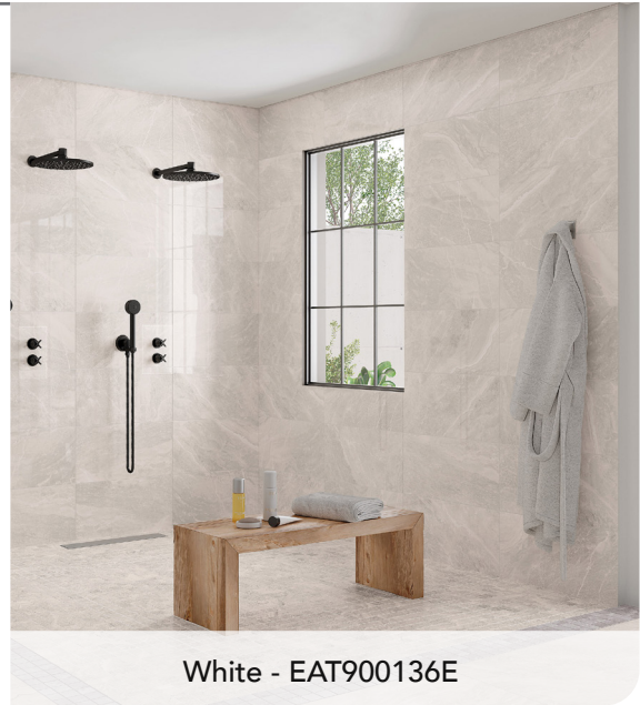
White - EAT900136E