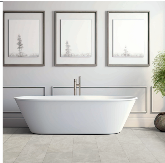
Stone Grey - EATSS261224JMK1P