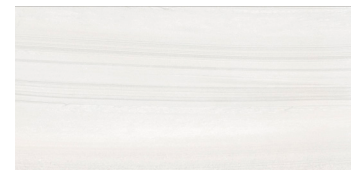
Marshmallow - EAT900086E

ATTENTION: Be sure to specify the product with the proper wear rating for the specific area to be covered.