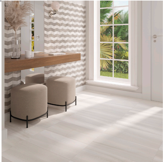
Marshmallow - EAT900086E