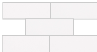
Artic - EAT29384E (Glossy)

ATTENTION: Be sure to specify the product with the proper wear rating for the specific area to be covered.