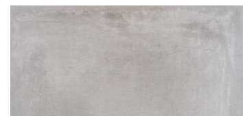
Silver - EAT900055E

ATTENTION: Be sure to specify the product with the proper wear rating for the specific area to be covered.