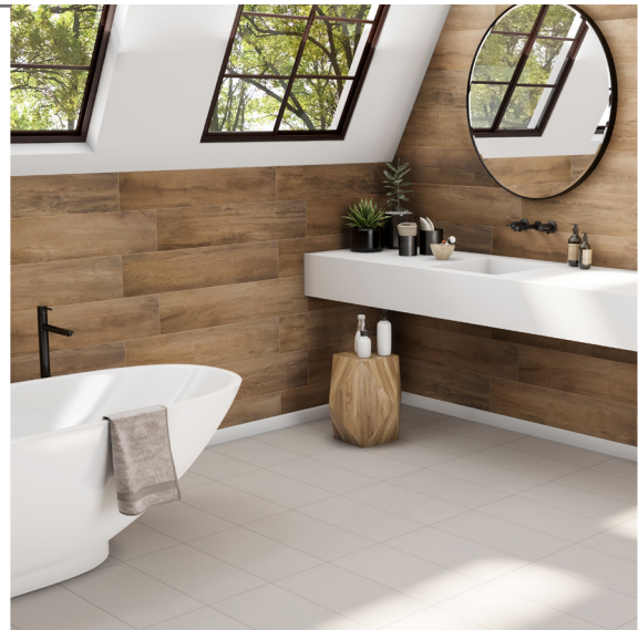
Chalk - EAT900052E