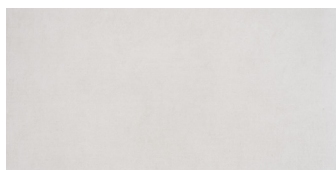
Chalk - EAT900052E