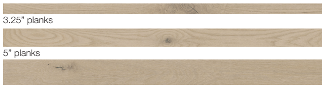
Cumberland CNP 301 / CNP 501 / CNP 701