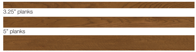
Shenandoah CNP 303 / CNP 503 / CNP 703