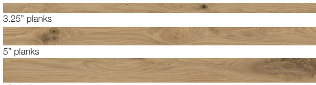
Piedmont CNP 300 / CNP 500 / CNP 700

The Anthem Collection by EarthWerks is rooted in patriotic tradition, celebrating the centuries-old use of hardwood flooring as a preferred décor choice in American-made flooring. Named for the hues found in America's majestic mountain ranges, each of these stunning hardwoods feature warm and inviting colorations paired with the distinctive graining of grand oaks. The Anthem Collection reminds us of the history that hardwood flooring plays in American design, while providing enhancements through modern technology for increased durability and ease of maintenance.