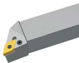
Right hand style