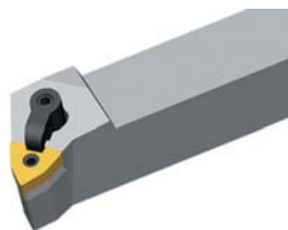
Right hand style