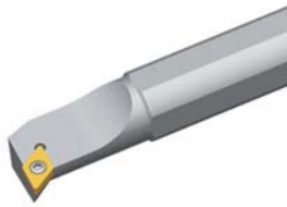
Right hand style