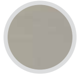
SINGULAR 1002 BRUSHED NICKEL