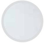
SINGULAR 1001 CHROME POLISHED