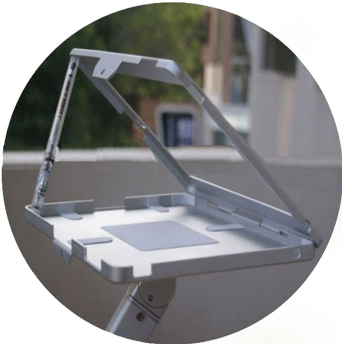
Table pc security lock display is like a small box, you can open the cover and put ipads/tabet pc in, close and lock it.