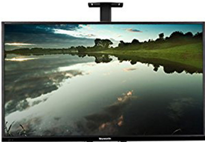
BIG TV Trolley