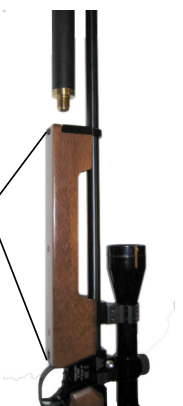
Forestock fixing screws.