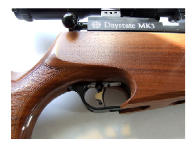
11. Your trigger is now fitted.