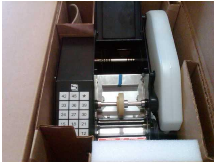
Figure 1 – Checking Package Contents