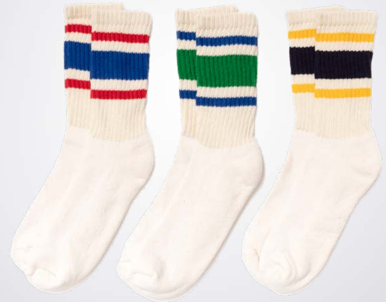
ROYAL / RED