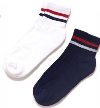
The Kennedy Quarter Crew