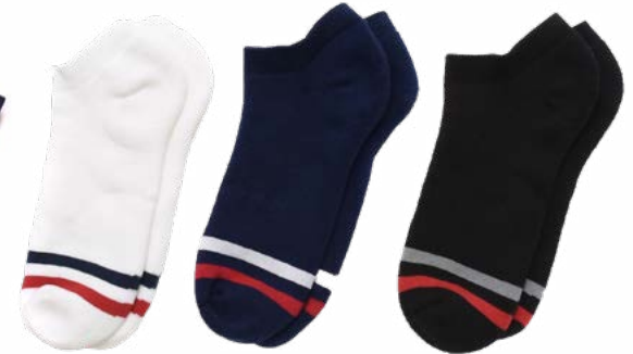
The Kennedy Ankle Sock