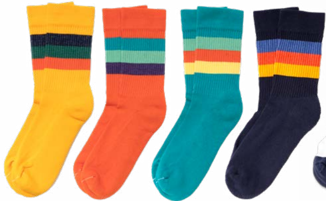
The Sol Sock