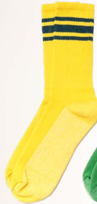
YELLOW / TEAL