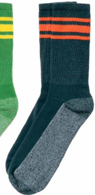
TEAL / TANGERINE