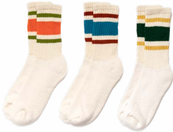
Retro Seasonal Quarter Crew