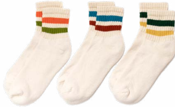
Retro Seasonal Quarter Crew