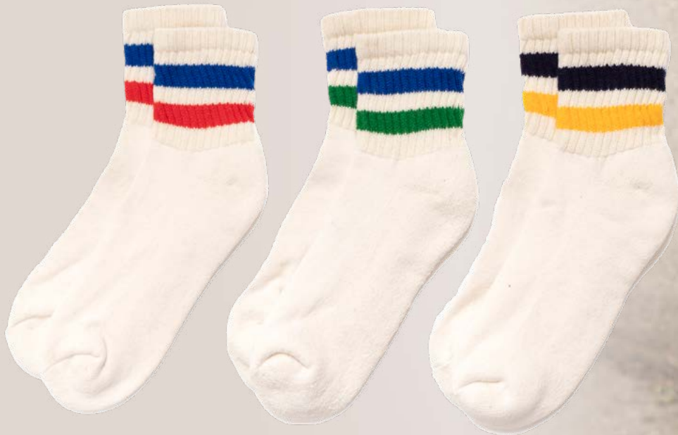
ROYAL / RED