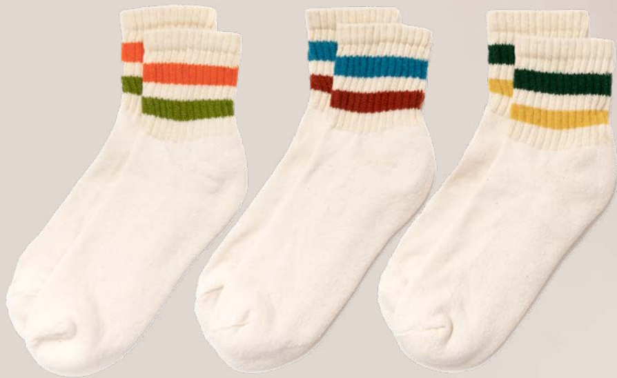
ORANGE / CHIVE