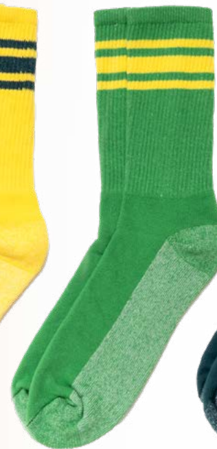
SAPPHIRE / YELLOW