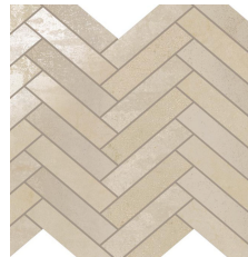
SAHARA BEIGE LCNY-2339