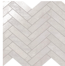
SNOWFLAKE MIRAGE LCNY-2342