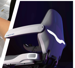
Gull wing back light