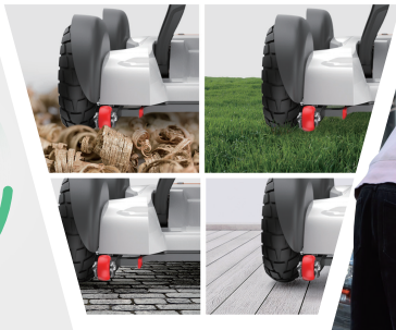
Omni-directional wheel fit all kinds of terrain