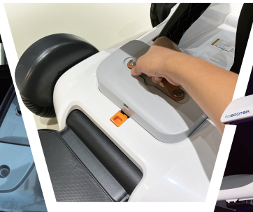
Removable lithium battery