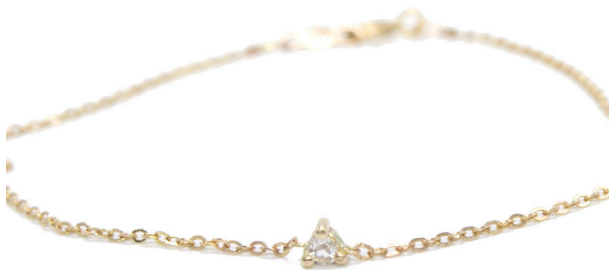
ROSE CUT DIAMOND BRACELET