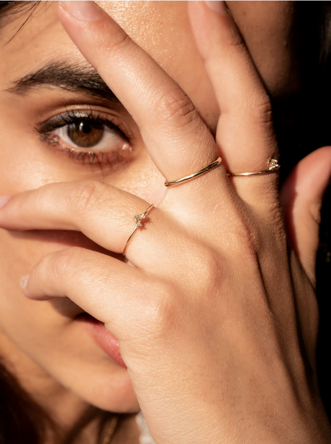
coronet diamond ring edith diamond cuff kerouac diamond cuff