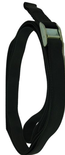
Adjustable Hanging Strap