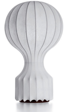
○ FU260109 White