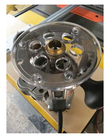
Figure 3 router with 1" bushing installed.