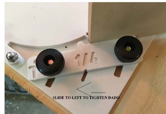
and the pivot plate. Press gently and tighten the knobs snugly. Slide set plate left or right to adjust cut.

Install the set plate and push the pivot plate against the left stop as shown; place a sample of the material between the straight portion of the pivot plate and the set Insert a sample of the wood between the set plate plate. Press the set plate trapping the material between the pivot plate and the set plate.