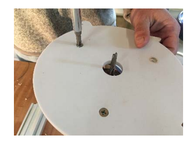
The pivot plate is marked and drilled, then countersunk to fit a router.

Option 1: Remove the pivot plate from the jig by removing the three retaining screws. Place the router on top of the pivot plate and note the position of the router handles and other fittings. The router should be turned until the handles and fittings will not interfere with the set plate knobs when the router base is pivoted during use. The opening in the pivot plate should be centered on the router bit opening. Carefully mark the location of router mounting holes. Drill the mounting holes and countersink them so the screw heads are just below the bottom surface of the pivot plate. Reinstall the pivot plate into the jig and tighten all the screws. The pivot screw is secured with a special nylon lock nut. Tighten the screw firmly, then back off <sup>3</sup>/<sub>4</sub> turn to allow smooth movement of the pivot plate.