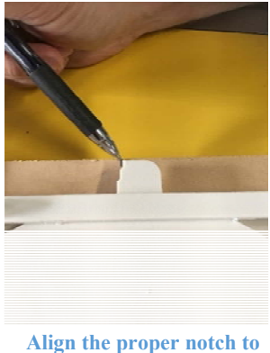
Align the proper notch to match your bit size. 1/4" bit shown.

Place the DadoRight<sup>™</sup> over the Kreg<sup>™</sup> extrusion and adjust the position of the guide clamp to the desired position. The DadoRight<sup>™</sup> pivot plate contains an alignment indicator that will closely correspond to the left edge of the dado when the pivot plate is against the left stop. It is best to make a test cut and compare the actual position with the indicator. Any variation is the result of mounting the router a little off-center or runout in the router. A user can quickly note the alignment of the test cut versus the indicator and use this knowledge to set up future cuts accurately and easily.