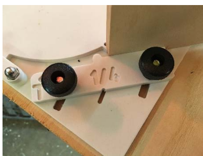
Figure 1 Stop is set to limit travel of pivot plate

The system uses a pivoting baseplate and a router. One side of the movement is limited by a fixed stop and the other side is controlled by an adjustable set plate. A perfect dado is easily made by setting the set plate and moving the DadoRight <sup>TM</sup> along the Kregl<sup>TM</sup> guide rail while simultaneously holding the router against the fixed stop. At the end of the first cut, the router is pivoted against the set plate and drawn back towards the operator. The travel of the DadoRight <sup>TM</sup> is controlled, and no matter how many passes are used to clean the cut, the final product is a great fit simply and easily.