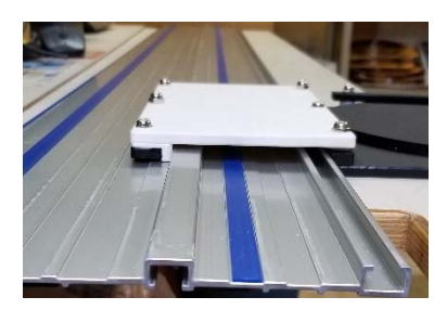
Figure 3 Place over extrusion, loosen all 3 screws, adjust, then tighten.

The DadoRight<sup>TM</sup> works on the narrow side of the Kreg<sup>TM</sup> extrusion as shown. Slightly loosen the three screws on the outside edge of the mounting assembly. Place the DadoRight<sup>TM</sup> over the Kreg<sup>TM</sup> extrusion. Insert the tip of a screwdriver into the end of the adjustable track guide that rides in the center of the extrusion. Adjust the width of the grey portion to tighten the jig to the track. Adjust both ends and then tighten the screws snugly. The DadoRight<sup>TM</sup> has small slots that allow for precise adjustment. When properly set, the DadoRight<sup>TM</sup> should slide smoothly along the guide without excessive play.