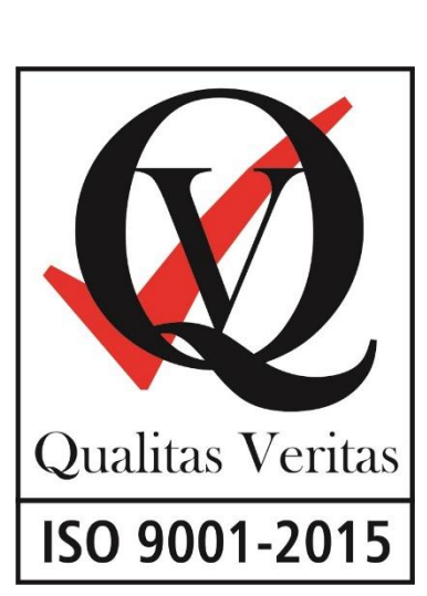
On behalf of CDL Group Ltd