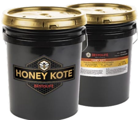
5 Gallon Plastic Pail