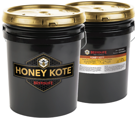
5 Gallon Plastic Pail