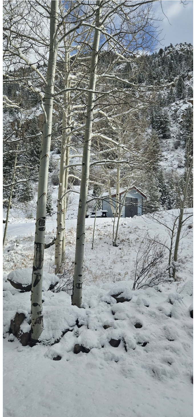
Snowy morning, Georgetown, CO