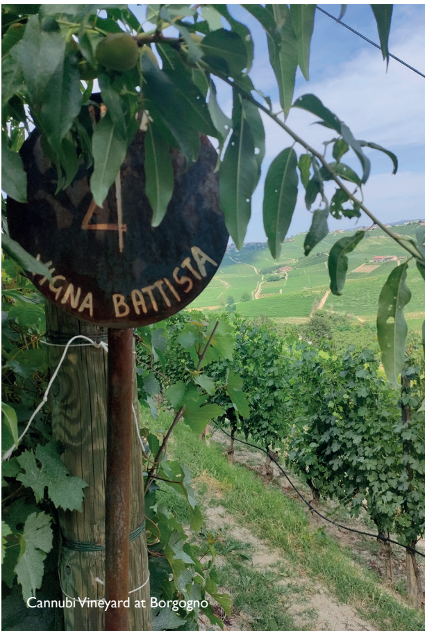
Cannubi Vineyard at Borgogno