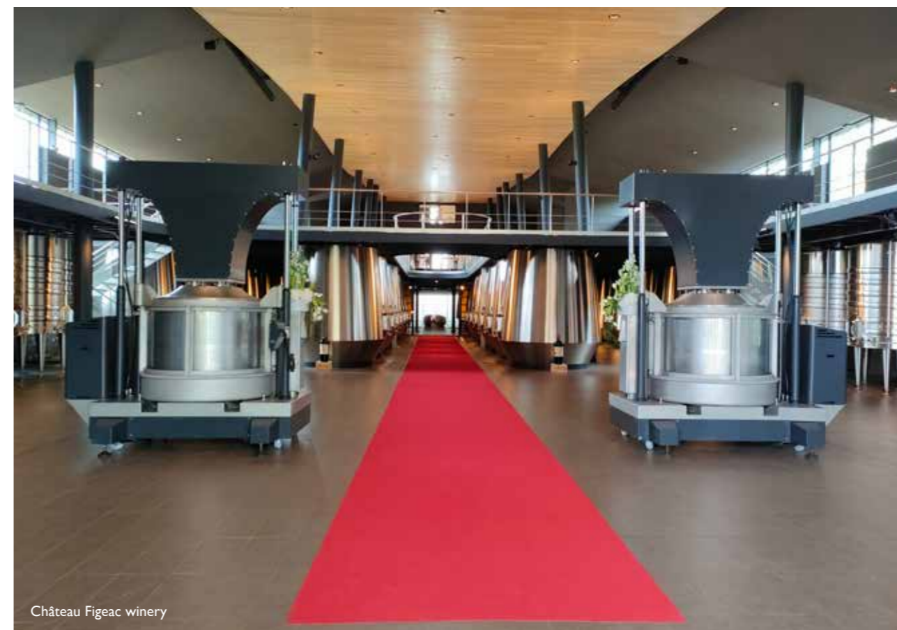
Château Figeac winery

Château Palmer, 3e cru classé Margaux DCR24022 6bts £1788 A big, long-term prospect with gutsy tannin, almost over-ripe but chock full of ripe damson fruit that needs the grip to work. Plenty of alcohol but balanced by the quality of fine tannin and density of fruit. Impressive, if powerful and somewhat atypical. 5-15+ years.