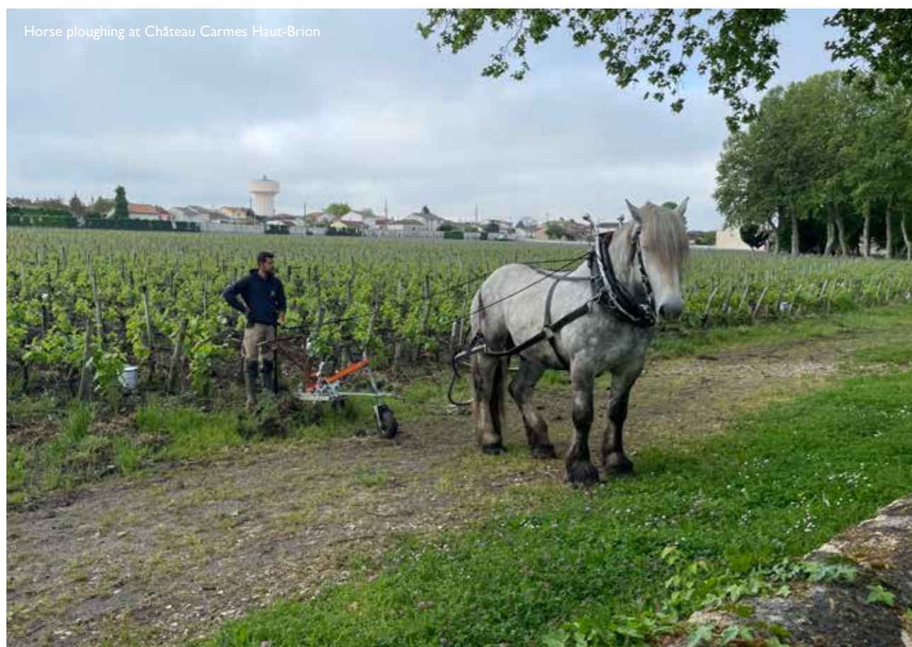
Horse ploughing at Château Carmes Haut-Brion