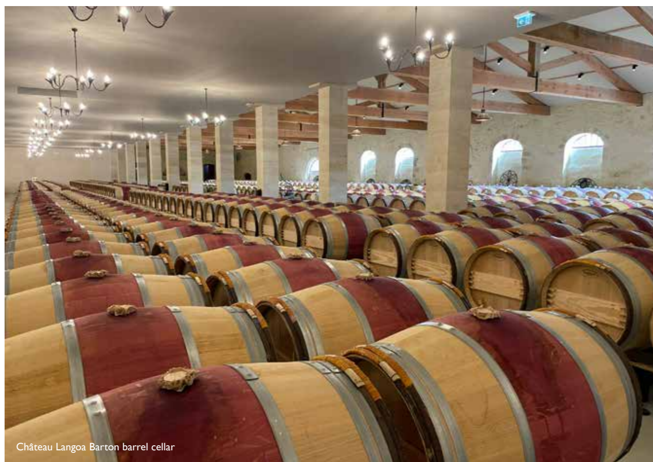
Château Langoa Barton barrel cellar