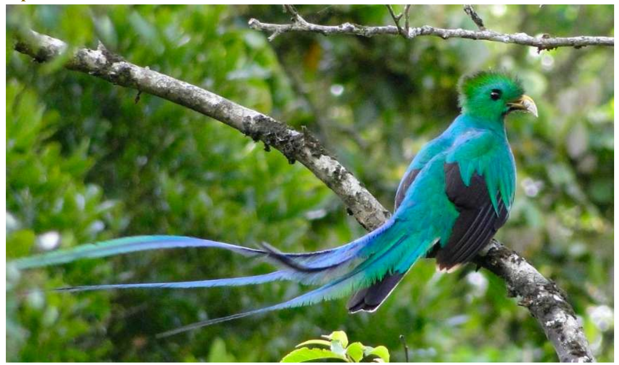
DAY 8 Explore Mount Totumas

Begin the day with a delicious breakfast and then set off on the lodge's network of hiking trails. Discover hidden waterfalls, traverse moss-covered bridges, and venture into the heart of the cloud forest. Along the way, keep an eye out for the abundant wildlife that inhabits the area. You may spot the Resplendent Quetzals fluttering through the canopy or a playful spider monkey swinging from tree to tree. Your local guide will share insights into the flora and fauna you encounter. During your exploration, you'll come across breathtaking viewpoints that offer panoramic vistas of the surrounding mountains and valleys. Take in the sweeping landscapes and capture photographs that encapsulate the beauty of this pristine environment. After a day of adventure, return to the lodge and treat yourself to a well-deserved relaxation session. Unwind in the cozy common areas, immerse yourself in a good book, or enjoy the stunning views above the canopy from the lodge's terrace. If you are still up for a 75-minute forest trail hike descending at 250m elevation you'll be rewarded with a relaxing bath soaking in the natural hot springs surrounded by the sights and sounds of nature. No worries about hiking back up the steep trail to Mount Totumas. You have an included complimentary return transfer making sure you'll be back in time for the hearty farewell dinner. (BLD)