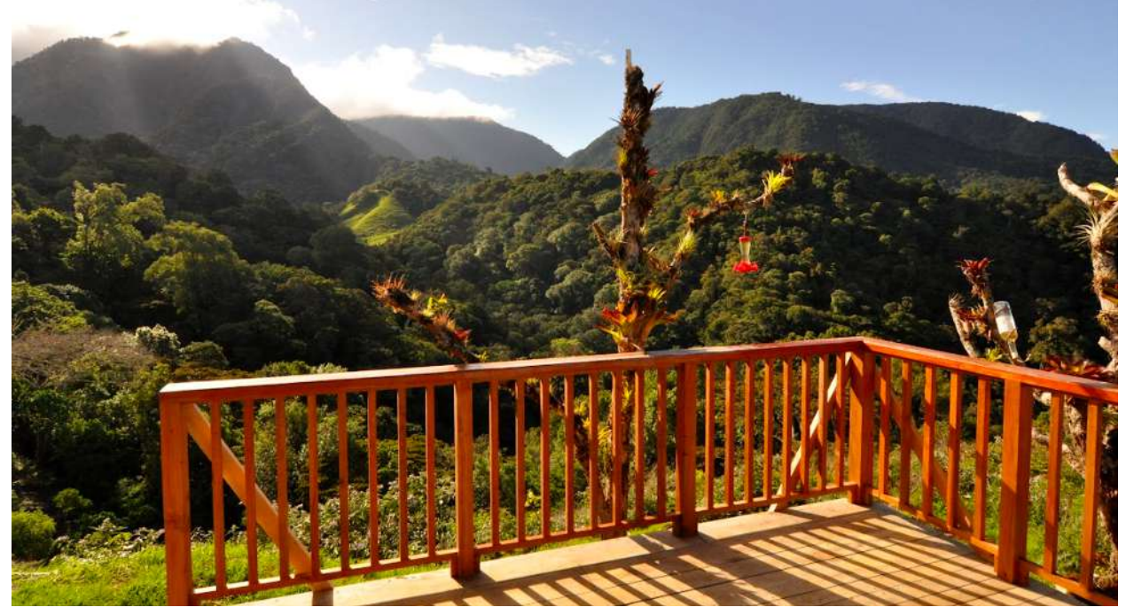
DAY 7 La Amistad International Park, UNESCO World Heritage Site