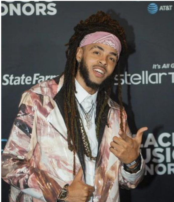
credit: Dee-1 - 2019 Black Music Honors - Atlanta, GA/ Jamie Lamor Thompson via Shutterstock