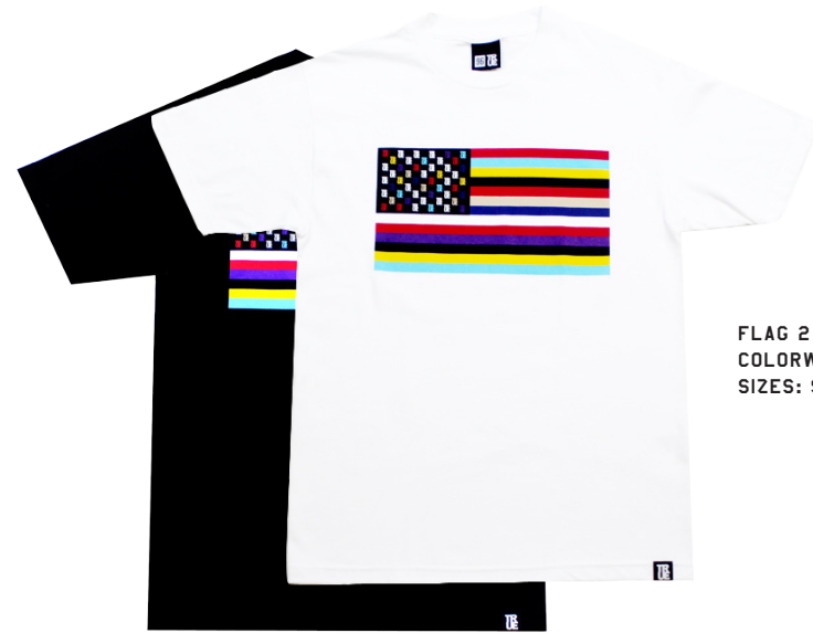
FLAG 2 SST MENS COLORWAYS: WHITE/BLACK SIZES: S-3XL