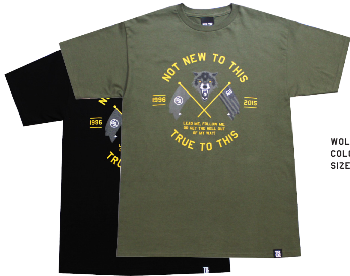
WOLVES SST MENS COLORWAYS: ARMY GREEN & BLACK SIZES: S-3XL