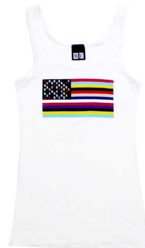
FLAG 2 TANK TOP WOMENS COLORWAYS: WHITE SIZES: S-L