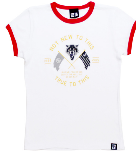
WOLVES RINGER TEE WOMENS COLORWAYS: WHITE/RED SIZES: S-L