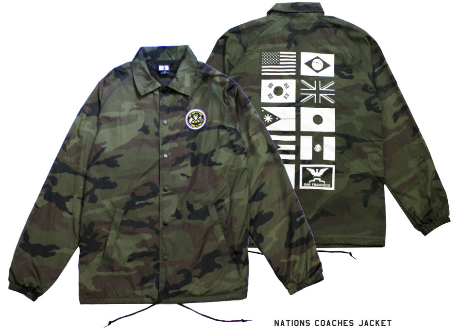
NATIONS COACHES JACKET COLORWAYS: CAMO SIZES: XS-3XL