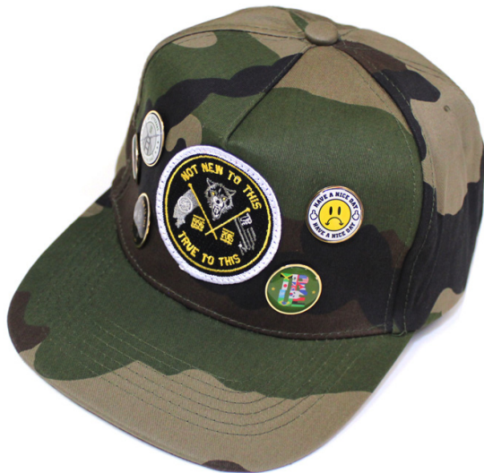
WOLVES SCAP W/ PIN SET COLORWAYS: CAMO SIZES: O/S