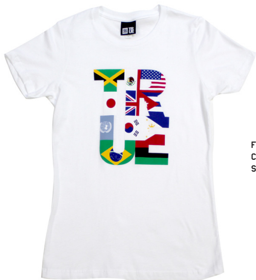
FLAGS FILL SST WOMENS COLORWAYS: WHITE SIZES: S-L