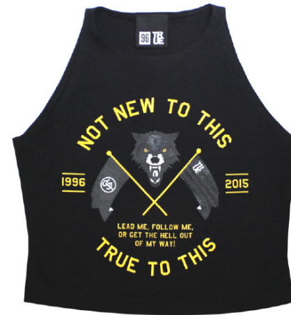
WOLVES CROP TOP WOMENS COLORWAYS: BLACK SIZES: S-L