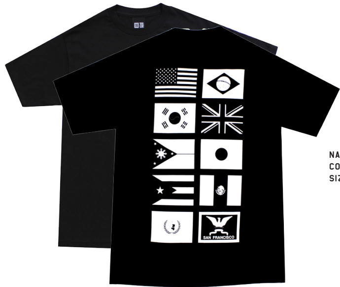
NATIONS POCKET TEE COLORWAYS: BLACK SIZES: S-3XL