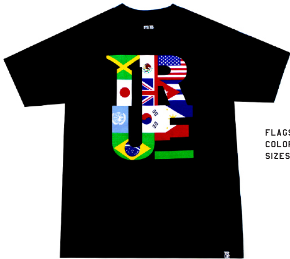
FLAGS FILL SST MENS COLORWAYS: BLACK SIZES: S-3XL