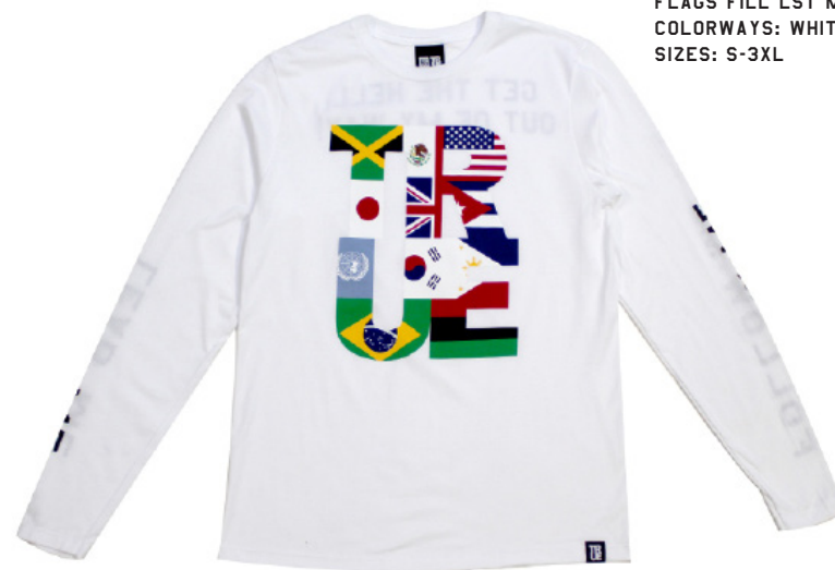
FLAGS FILL LST MENS COLORWAYS: WHITE SIZES: S-3XL