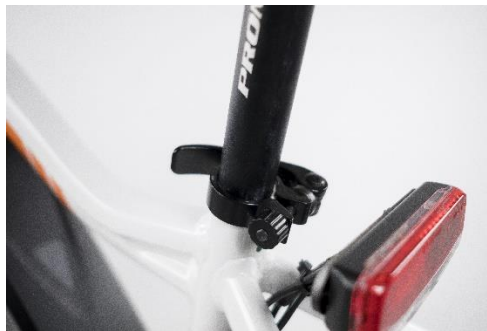
Quick release fully closed