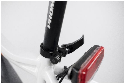
Quick release fully open