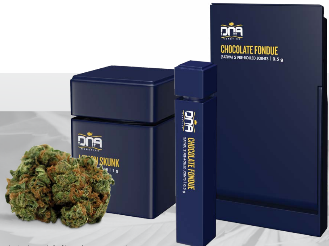
This packaging image is for illustration purposes only and differs from product packaging sold at retail.