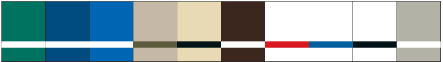
822-992 Teal/ White 822-592 ▲ Royal Blue/ White 822-503 Sapphire/ White 822-258 Bermuda Tan/ Dark Brown 822-854 Desert Sand/ Black 822-892 Coffee Bean/ White 822-246 White/ Red 822-205 Winter White/ Blue 822-244 ▲ Winter White/ Black 822-302 Ash Grey/ White