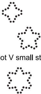
Picot V small stars