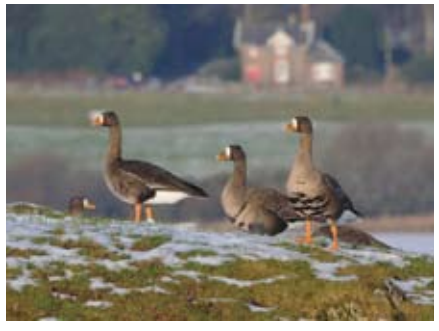
Greenland White-fronted Geese

Habitats: Farmland, woodland. marshes, river, old railway-line. Birds: Greylag, Pink-footed and Greenland white-fronted Geese. Whooper Swans and other wildfowl. including occasional Smew. Summer visitors include Osprey, Pied Flycatcher, Common Whitethroat, Sedge Warbler, Grasshopper Warbler. Wintering raptors.