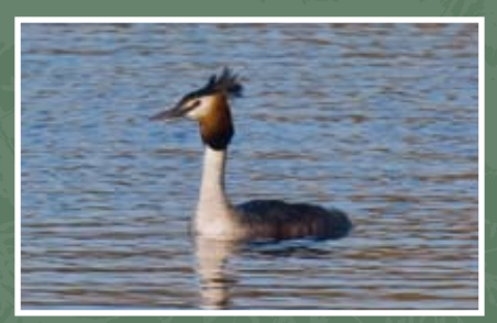
Great Crested Grebe

Beeswing, then take minor road half mile eastwards towards New Abbey.