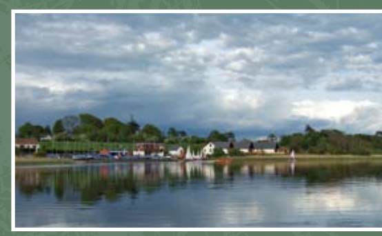
Castle Loch, Lochmaben

Contact: DGC Ranger Service 01387 260366