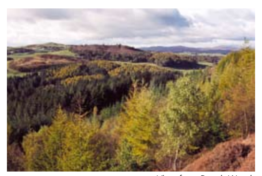
View from Doach Woods

Contact: Forestry Commission Scotland (Conservation Manager) 01387 860247.