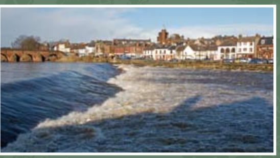
The Caul at Whitesands Dumfries