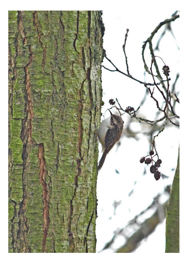
Treecreeper: Elizabeth Irwin

The path to the lochs went past a Rookery which was noisy as they usually are. The grass in front of the car park was quieter than usual with only a few Mallard and 2 Greylag Geese. There was a Mute Swan, Moorhen and Tufted Duck all easily visible from here. As we headed off around Birnie Loch the woodland gave us good views of Robin, Great Tit, Blue Tit and Long-tailed Tit. These were also making use of the bird feeders here. There was a group of 4 robins all in close proximity without any of the usual territorial aggressive behaviour. We saw several other groups of 3 or 4 Robins on the walk again happily co-existing. Perhaps they were part of a migrating group rather than residents?