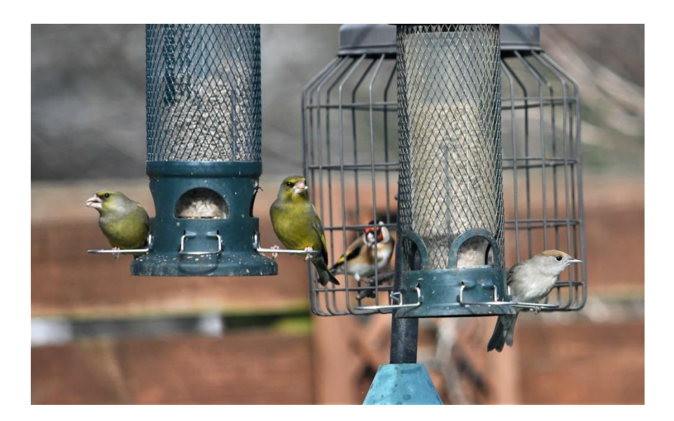
Garden Bird Feeder: Nigel Duncan

(details to follow; please make sure you're signed up to receive <u>Branch News & Events - Talks & Workshops</u>)