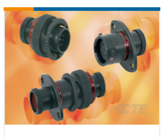
TE Model / Part #ASDD606-09PA-HE PLUG ASSEMBLY ASL 9-WAY