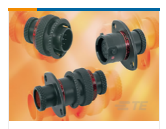
TE Model / Part #ASDD006-09PN-HE RECEPT ASSY 2 HOLE ASDD 9 WAY