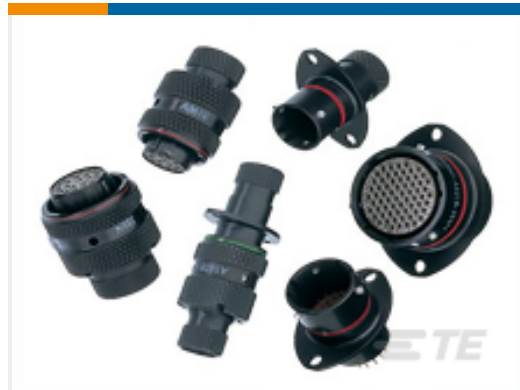
TE Model / Part #AS014-97SD CONNECTOR AUOSPORT S ERIES