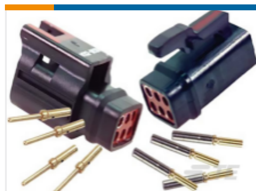
TE Model / Part #ASC105-06SD RECEPT.AS MODULAR. SKT.