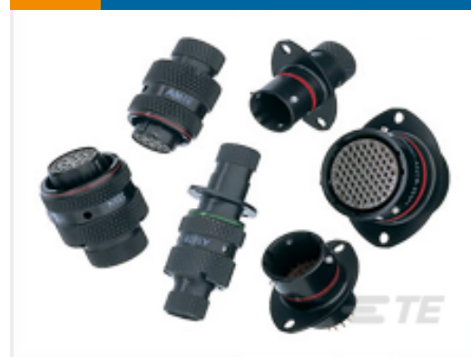
TE Model / Part #AS622-55PN PLUG BOOT TERMIN. TYPE 6